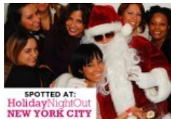
Spotted at: Holiday Night Out New York City