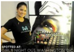
Spotted at: Girls Night Out Washington, D.C.