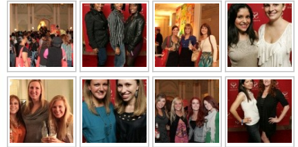
Gallery Glimpse: Girls Night Out in Atlanta, Fall 2011