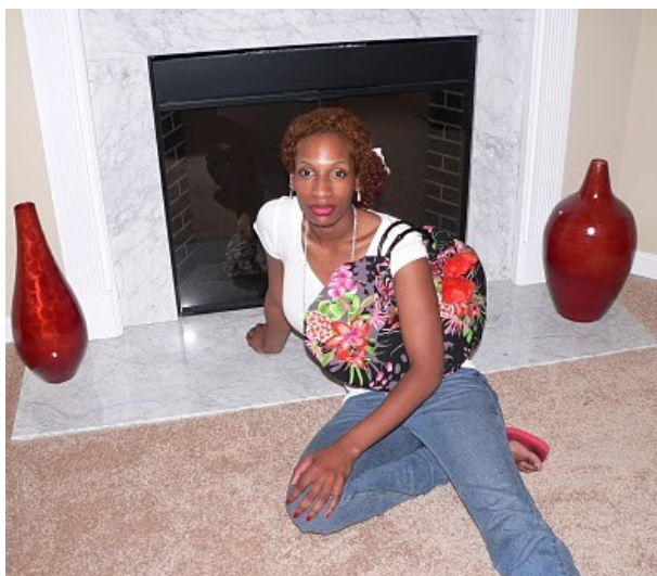
The attached roses really add character to the bag. This one didn't make the $50 cut, but I like the vintage look. Reminds me of Dorothy Dandridge in Carmen.